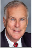
John Zorn, clarinet

Sonatas for Clarinet and Piano by F. Poulenc & by L. Bernstein